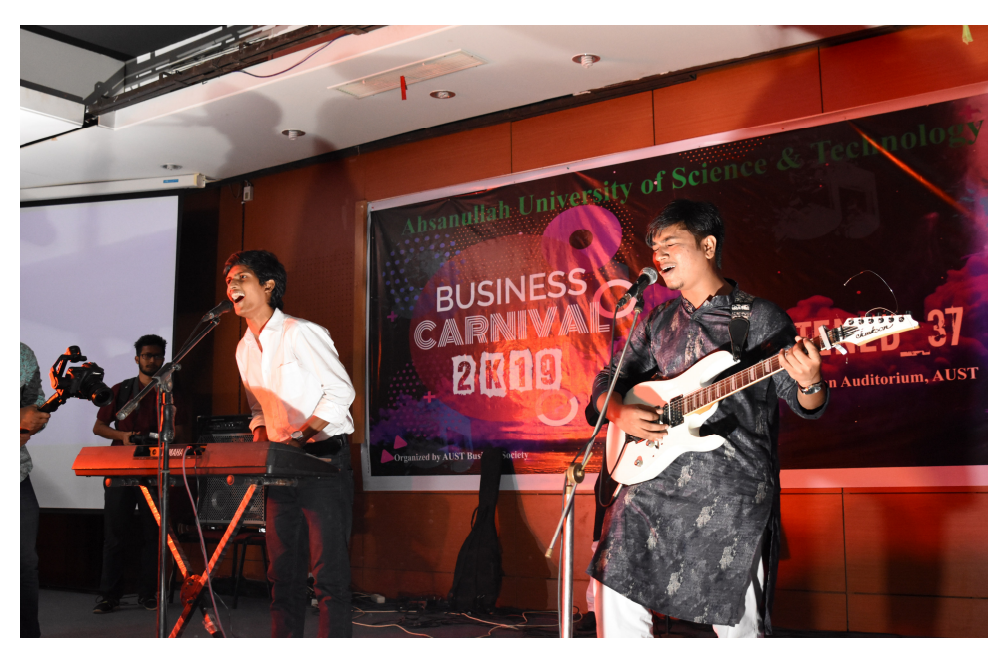
A moment of singing song by the students of BBA

As most of these activities are group-oriented, which have students from different niches, which give them a chance to more know about people of different passions and cultures. Besides this, they can also find clubs or groups that share similar social, religious or even entertainment interest for socialization. Interact with people from different backgrounds help in the development of interpersonal skills of students.