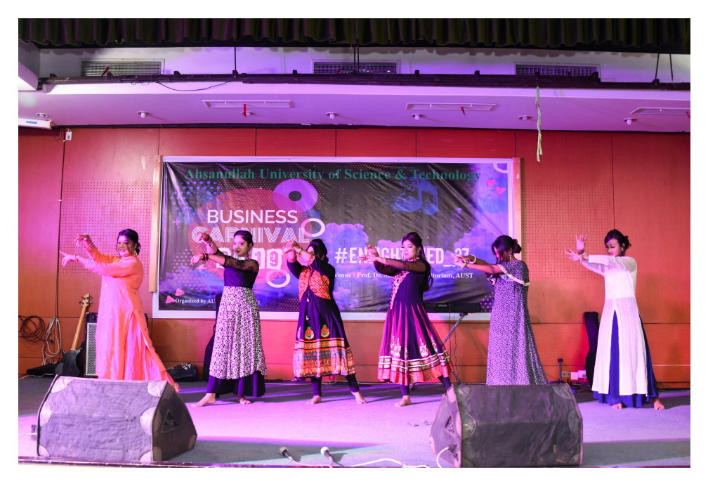
Group dance performing by the SoB students

As most of these activities are group-oriented, which have students from different niches, which give them a chance to more know about people of different passions and cultures. Besides this, they can also find clubs or groups that share similar social, religious or even entertainment interest for socialization. Interact with people from different backgrounds help in the development of interpersonal skills of students.